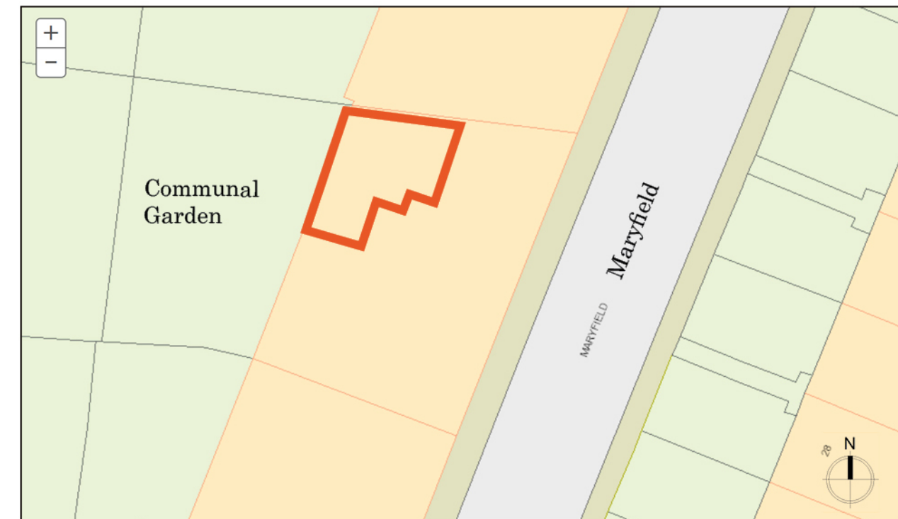
Location Plan 1:500 @A3