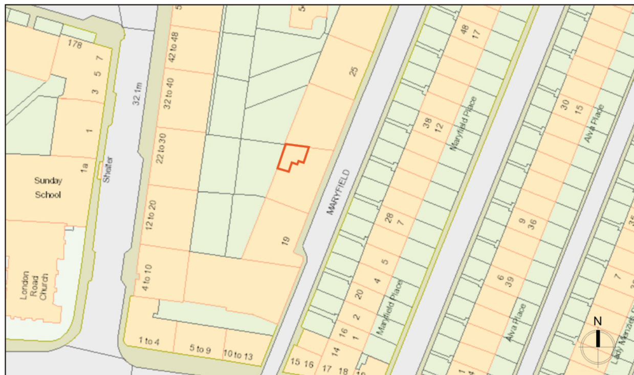
Location Plan 1:1250 @A3